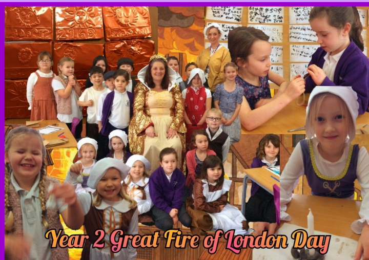
Year 2 Great Fire of London Day